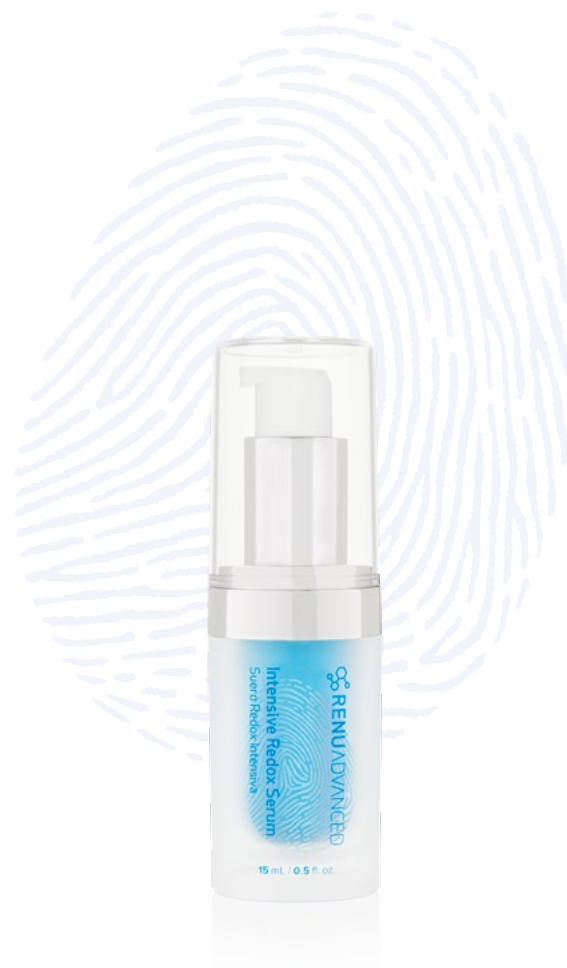
15 mL / 0.5 fl. oz. Price: $80 WSL / 60 PV